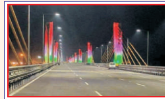
The Newly Inaugrated Cable Bridge on Narmada River (India's Longest Cable Bridge).