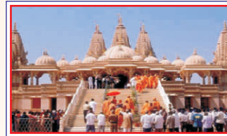
The Swami Narayan Temple.