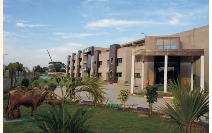
College of Agriculture, N.A.U., Campus Bharuch, Dist. Bharuch-392 012