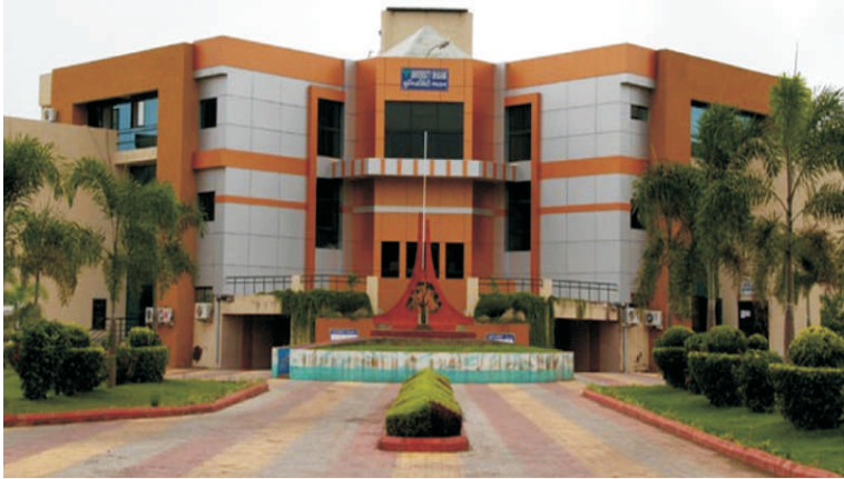
Navsari Agricultural University, Navsari Campus Administrative Building.