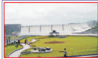
The water fall of Narmada Dam.